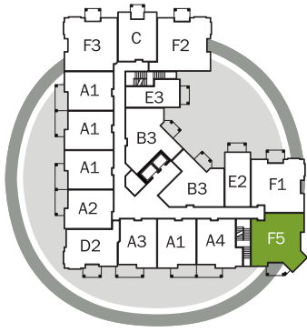
BUILDING B SECOND FLOOR