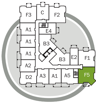
BUILDING B THIRD FLOOR