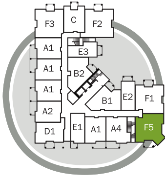
BUILDING B FIRST FLOOR