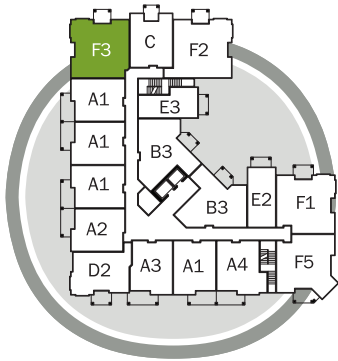
BUILDING B SECOND FLOOR