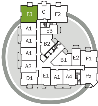
BUILDING B FIRST FLOOR