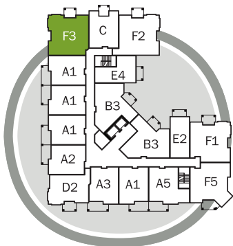
BUILDING B THIRD FLOOR