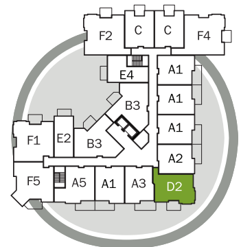
BUILDING A FOURTH FLOOR