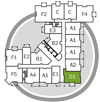
BUILDING A FIRST FLOOR