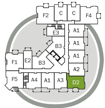
BUILDING A SECOND FLOOR