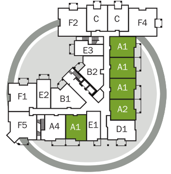
BUILDING A FIRST FLOOR