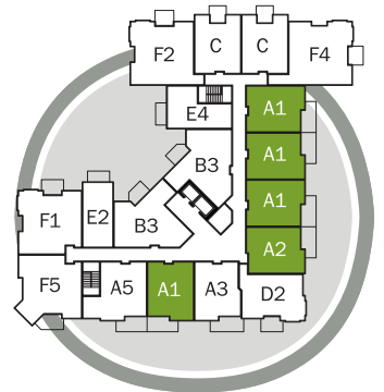
BUILDING A FOURTH FLOOR